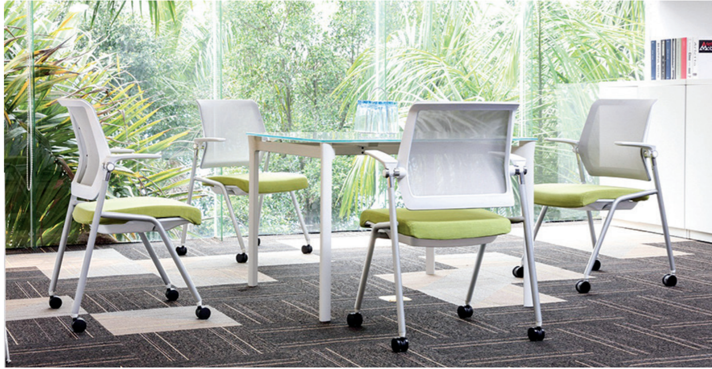
Seating shown is model TR-15-WG with Optional Seat Fabric

Trendi Nesting is our multipurpose wonder, effortlessly transforms from guest chair to nested to stacked, making storage and space management a breeze. With its sleek profile, contoured seat, passive back tilt and flip-up arms, Trendi Nesting redefines style, comfort, and performance in one elegant package.