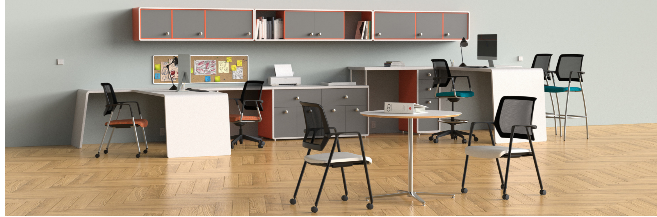
Seating shown are models TR-11-BB-S, TR-11-BB, TR-30-BB-S, TR-40-BB-S, and TR-40-SK-BB-S with Optional Seat Fabric