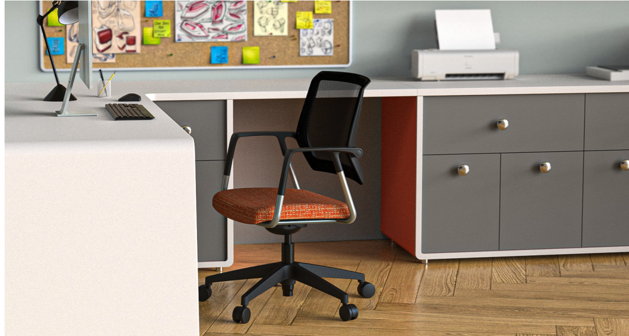
Seating shown is model TR-10-BB-5

Trendi 2.0 Management chairs combine comfort and mobility, making it a great fit for working spaces, conference rooms, and learning areas. Featuring height adjustment mechanism and passive flex back, additional ergonomic support. During those extra-long meetings or training sessions, the optional upholstered seat provides the comfort you desire.