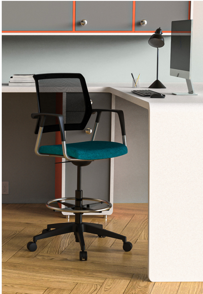
Seating shown is model TR-40-SK-BB-5

Trendi 2.0 Management chairs combine comfort and mobility, making it a great fit for working spaces, conference rooms, and learning areas. Featuring height adjustment mechanism and passive flex back, additional ergonomic support. During those extra-long meetings or training sessions, the optional upholstered seat provides the comfort you desire.