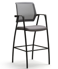
TR-30-BG Bar Height