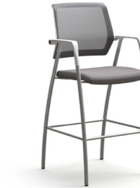
TR-26-WG Counter Height