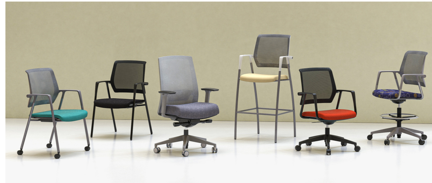
Seating shown from left to right are models TR-11-GG, TR-10-BB, TR-2.0-638-GG, TR-30-WG, TR-40-BB, and TR-40-SK-GG

Say goodbye to uncomfortable seating and hello to the ultimate seating solution with Trendi 2.0! Whether you need a task chair office, a stylish side chair for your meeting room, or a comfortable stool for your high counter, Trendi 2.0 has got you covered. With its innovative design and focus on promoting comfort and well-being, this collection is perfect for any environment. Get ready to enhance your performance while sitting in style with Trendi 2.0!