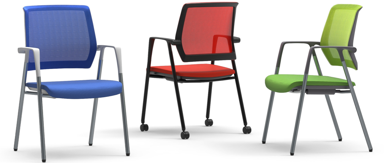
Seating shown are models TR-10-WG, TR-11-BB, and TR-10-GG shown with optional color mesh on passive flex backs