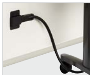
POWER ENTRY CABLE