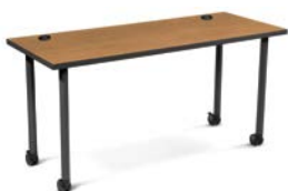
POST LEG Sturdy and affordable (glides or casters)

Time is money, and space is serious overhead. Huddle multi-purpose tables work with you to make the most of both. Tables are available with a choice of top shapes (rectangular or half-round) and bases (post legs, T-legs, or nesting bases). With a variety of options to choose from, you can specify Huddle tables that are easy to set up and easy to rearrange.