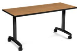
T-LEG Unobstructed leg room (glides or casters)