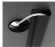
WIRE MANAGEMENT STRIPS