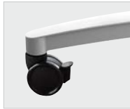
NESTING BASE/ T-LEG CASTER