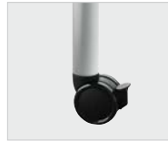
POST LEG CASTER Available on 24" and 30" D tables only.