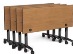
NESTING BASE Space-efficient storage (casters only)